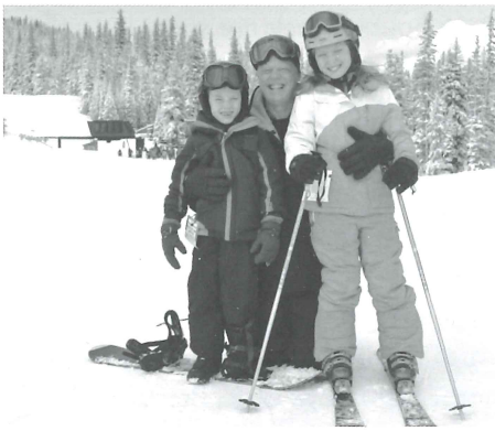
The author enjoys skiing with his family at Anthony Lakes ski resort, less than two hours from Pendleton.

and chat about the legal landscape. One taught me how to say “ORY-GUN.” They encouraged me to be strong and not take the down job market personally. There simply were no quality partnership track jobs available in the valley. My law school advisor in Cleveland was a Portland tax attorney for 20 years before he became a professor. He encouraged me to look for work east of the Cascades, especially if I wanted to get away from the rain. And man did it rain...nonstop it seemed until the Waterfront Blues Festival.